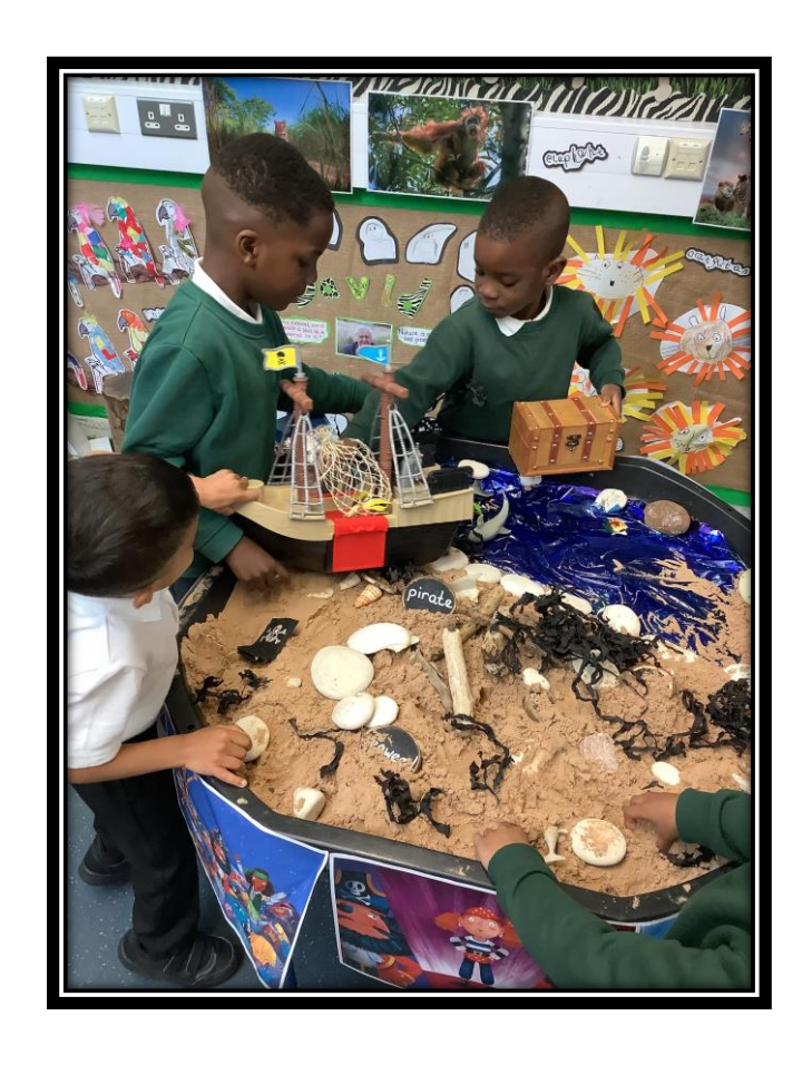
"Art is too important not to share."

The development of children's artistic and cultural awareness supports their imagination and creativity. It is important that children have regular opportunities to engage with the arts, enabling them to explore and play with a wide range of media and materials. The quality and variety of what children see, hear and participate in is crucial for developing their understanding, self-expression, vocabulary and ability to communicate through the arts. The frequency, repetition and depth of their experiences are fundamental to their progress in interpreting and appreciating what they hear, respond to and observe.