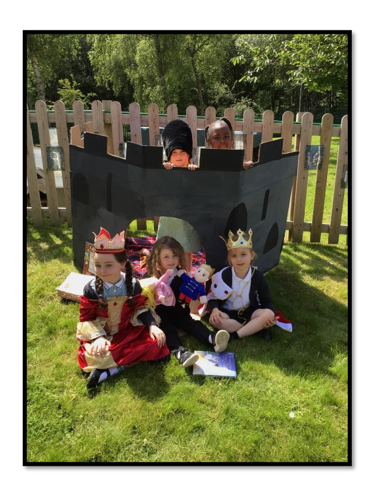
"Educating the mind, without educating the heart, is no education at all."