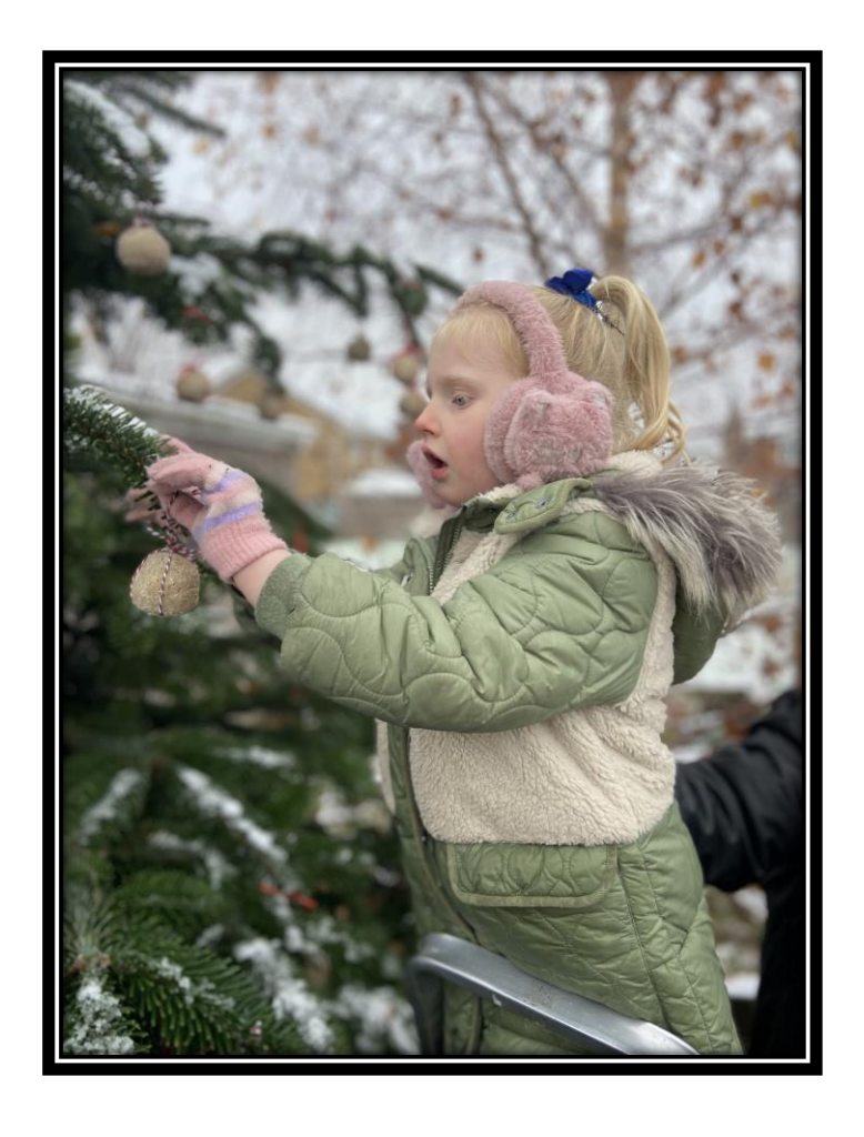
"Curiosity is the wick in the candle of learning."

Understanding the world involves guiding children to make sense of their physical world and their community. The frequency and range of children's personal experiences increases their knowledge and sense of the world around them – from visiting parks, libraries and museums to meeting important members of society such as police officers, nurses and firefighters. In addition, listening to a broad selection of stories, non-fiction, rhymes and poems will foster their understanding of our culturally, socially, technologically and ecologically diverse world. As well as building important knowledge, this extends their familiarity with words that support understanding across domains. Enriching and widening children's vocabulary will support later reading comprehension.